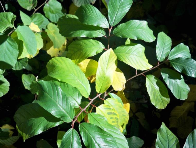
Figure 2. Magnesium deficiency occurs first in oldest leaves.

There was no consistent success with this approach. The scientific literature is full of studies that contradict each other. Researchers warned of damage to plants from the overuse of magnesium sulfate (Boynton 1943; Boynton et al. 1943; Nagai et al. 1966). Unfortunately, because foliar sprays have a quick and obvious effect on leaf color, frequent applications of foliar magnesium sulfate became the popular way for tree fruit growers and others in production agriculture to temporarily alleviate the problem. This approach does nothing to alleviate the nutrient imbalances in the soil.