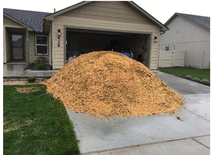
Figure 5. Arborist wood chips are an ideal mulch for soil improvement.