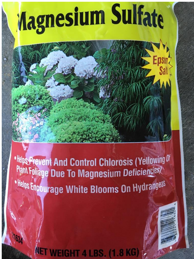
Figure 1. Magnesium sulfate, sometimes sold as Epsom salt.

Magnesium sulfate, or Epsom salt, is a naturally occurring mineral consisting of magnesium and sulfur ( \text{MgSO}_4 , Figure 1). It readily dissolves in water, releasing positively charged magnesium ions ( \text{Mg}^{+2} cations) and negatively charged sulfate ions ( \text{SO}_4^{-2} anions).