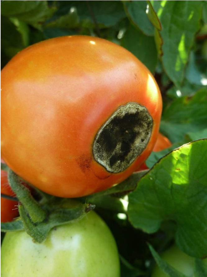
Figure 3. Blossom end rot on tomato is not related to magnesium deficiency.